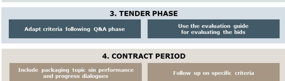
Figure 1 Guide and Decision Tree with the purchase phases